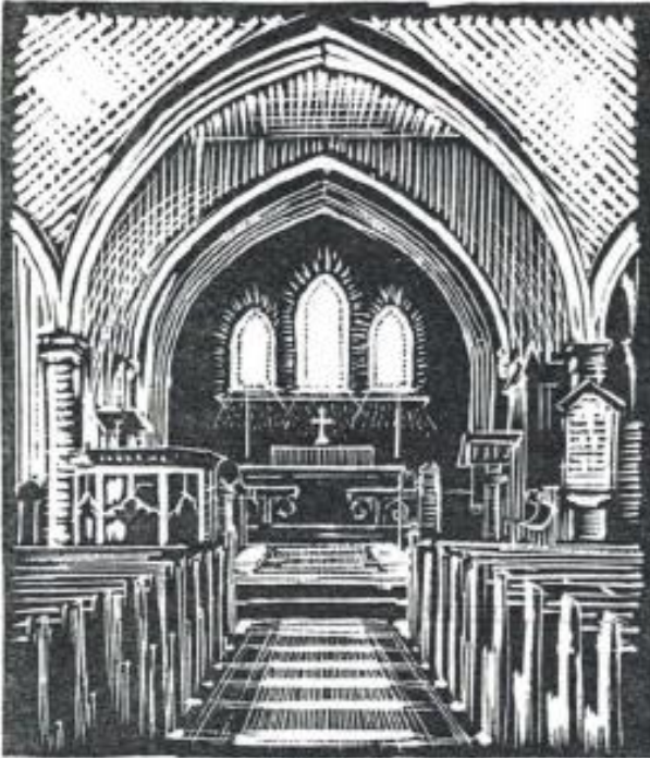
Interior of St. George's Church

Here let true faith, the fear of God and brotherly love ever remain. This place is set apart for prayer and for the praise of the most holy name of our Lord Jesus Christ; whoever liveth, with the Father and the Holy Spirit, one God, world without end. Amen. Book of Common Prayer, Page 714.