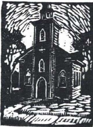
Trinity Church, Colborne, 1846-1935

In July, 1844, after being made a priest in Toronto on June 30th., he was appointed Travelling Missionary in the Newcastle District, giving particular attention to the Missions of Colborne and Grafton and making Colborne his home.