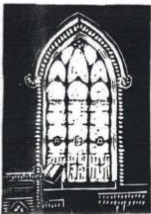
The West Window, St. John's Church, Centreton