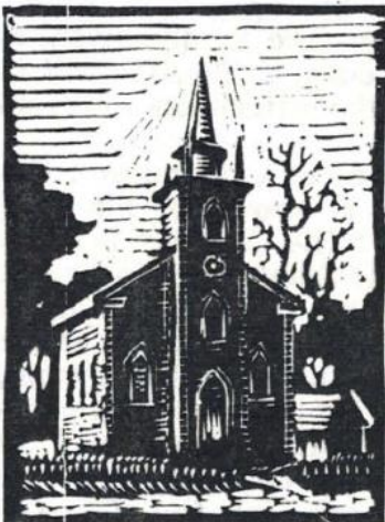
St. George's Church, 1844-1908